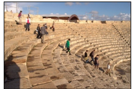
In the Ruins of Kourion, Cyprus (2009)