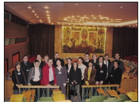
At the United Nations (2004)