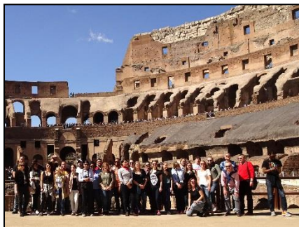
Inside the Roman Colosseum (2017)